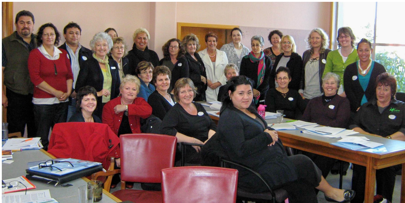
Participants and presenters at the Hamilton “Working for Effective Employment Relations” workshop, June 18.