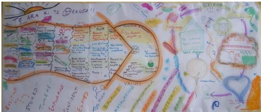
Figure 2. An example of a completed PATH

In these four examples, the PATH methodology was used because it was a structured, collaborative and inclusive way of planning; the end result being a visual representation of the desires of the collective, rather than a written document (see Figure 2 for an example of a completed PATH). Participants enjoyed engaging in the process, and the graphic images served as a visual anchor and ongoing 'documentation' of their hopes and dreams.