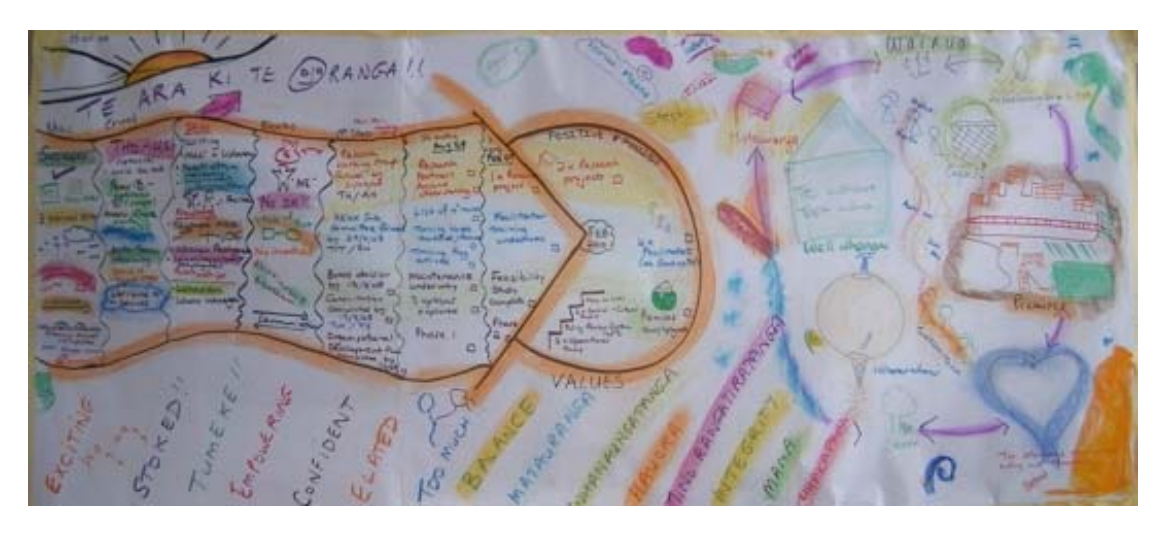
Figure 2. An example of a completed PATH

In these four examples, the PATH methodology was used because it was a structured, collaborative and inclusive way of planning; the end result being a visual representation of the desires of the collective, rather than a written document (see Figure 2 for an example of a completed PATH). Participants enjoyed engaging in the process, and the graphic images served as a visual anchor and ongoing 'documentation' of their hopes and dreams.