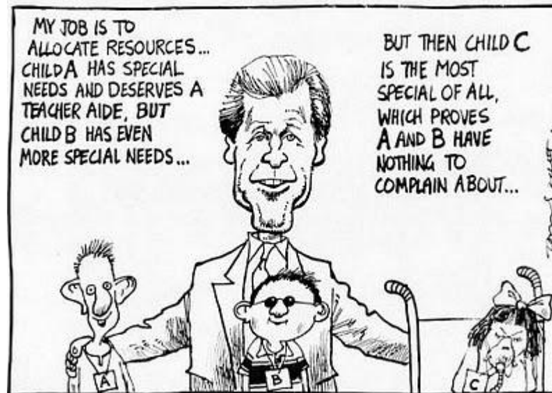
Figure 8: Minister of Education Lockwood Smith 28 November 1995 by Tom Scott.

Source: Timeframes National Library of New Zealand ID: H-242-020. Used with permission.