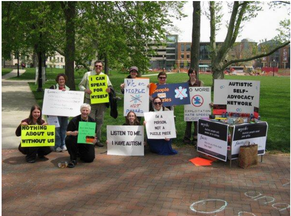
Figure 5: Autistic Self Advocacy Network protest at a university in the US