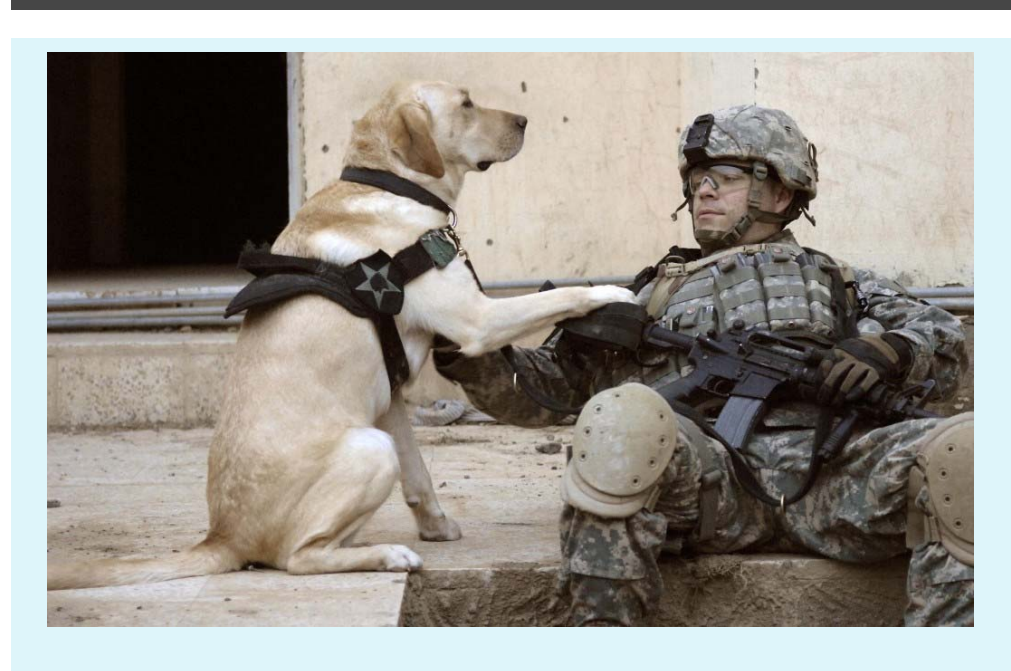
Iraqi Soldier and his dog

Source: http://www.chelseadogs.com/blog/top-10-army-dogs/