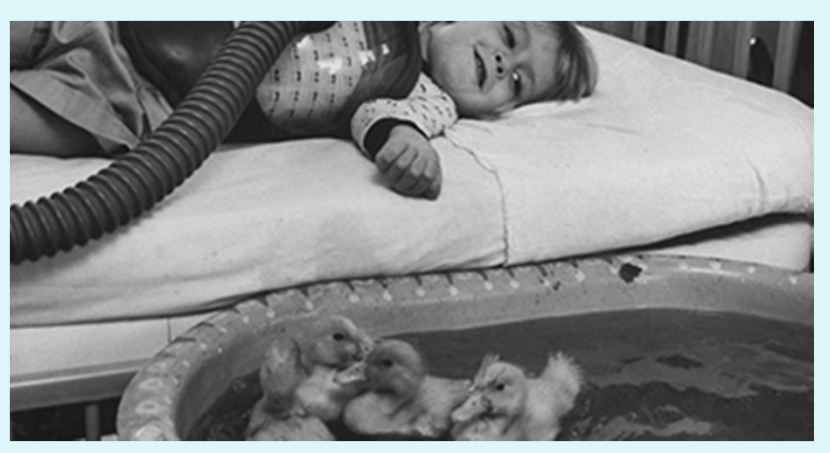
Animals being used as part of medical therapy, 1956

Codes of ethics could be pitched at different levels depending on the service of the animal in the helping relationship with humans. Social service organisations should consider at each level – i.e. what does providing the appropriate capabilities to flourish mean at each level of service.