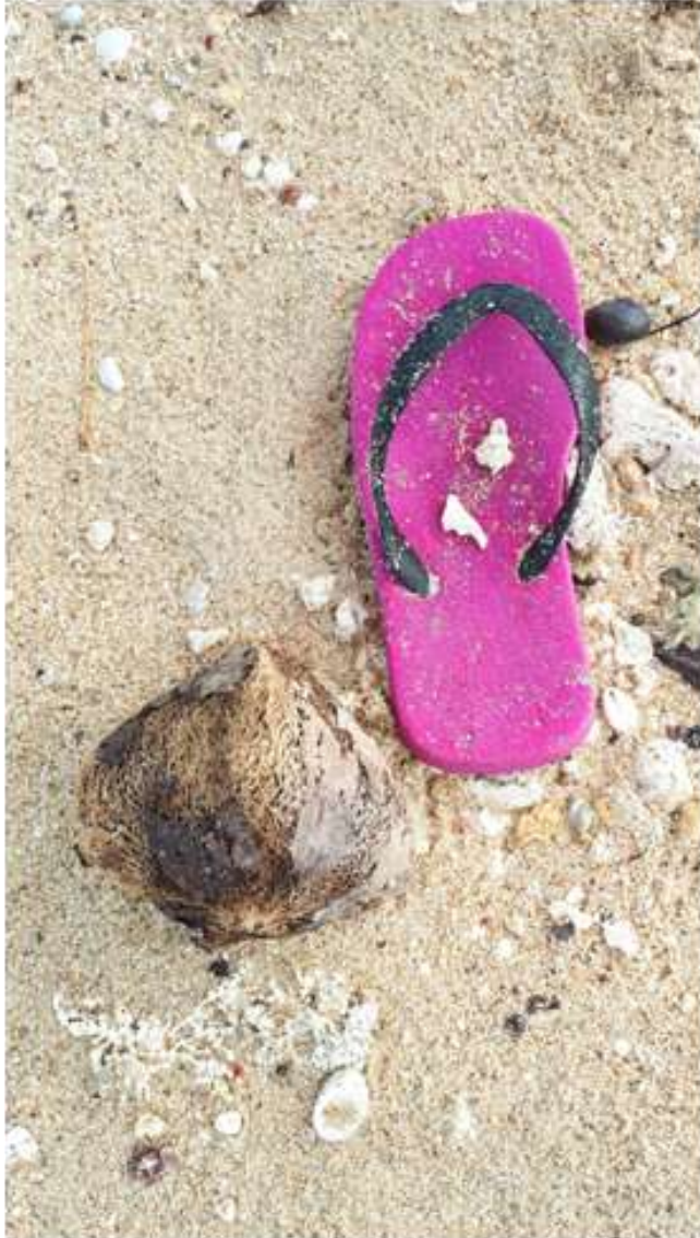
A jandal, a decaying coconut: modern, traditional. Both valued.

Community-adaptation, like development, is multi-dimensional and complex by design. Solutions can only be applied if they are understood from this complexity. Only then will local people be given the resources to change for something better.