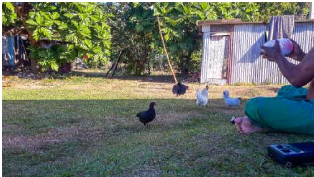
Figure 7: Calling the chicken, Taviya village, Ovalau Island.

Another principle of talanoa that has informed Va conversations is expressed as the researcher placing themselves in the research (Mafileo, 2018). Conversations can also include exchanges that are non-verbal (Feldman, 1999) and some Va conversations in this research had few words, as the following journal entry and Figure 7 demonstrates: