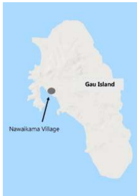
Figure 17: Map of Gau Island, Lomaiviti Group of Island, showing the research locality of Nawaikama Village.

This section presents Va conversations from the village of Nawaikama on Gau Island, in the Lomaiviti District, Eastern Fiji (see Figure 17).