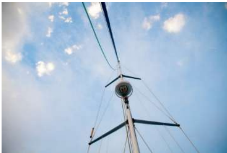
Figure 3: Pacificscape: Technocentricity dominates the space.

In Figure 3, the technical ability of the boat is seen to harness and control the clouds. Here, the boat favours its own structural connections and not connections with other elements. The narrative can only be drawn to the central presence of human-made structures which have the potential to not only dominate but also exploit the environment and those who rely on it. The wind gauge at the top of the mast and the electronics that run down the mast enable the boat to be navigated from inside the cockpit. The skipper does not need to look at his surroundings if she or he chooses not to. Many boats move through the ocean without awareness, until they hit danger which forces them to take appropriate action.