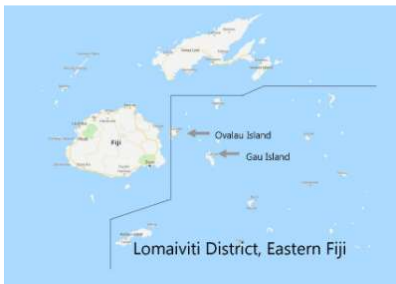
Figure 9: Research localities in Lomaiviti District.

Figure 9 shows the Lomaiviti District in Eastern Fiji, and the two research localities of Ovalau Island and Gau Island. I wanted to visit more than one locality, so I could obtain a broad spectrum of whether adaptation is informed by local concerns.