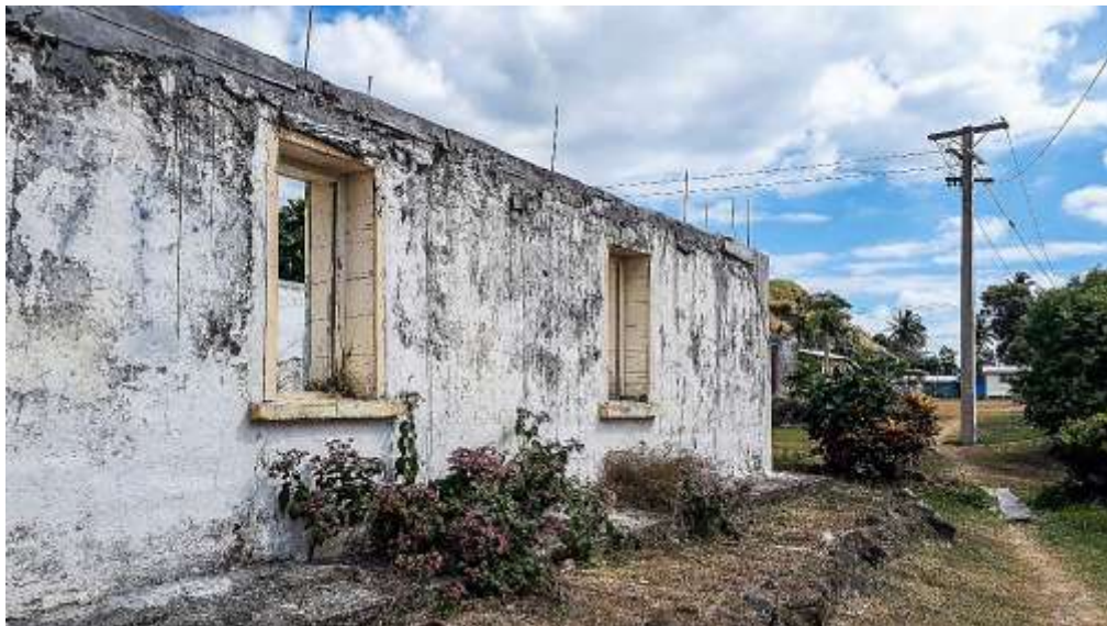
Figure 14: Church in Arovudi, after Cyclone Winston.

Many people were still rebuilding their homes as well as community infrastructure (see Figure 14) that were damaged from Cyclone Winston (the cyclone) two and a half years earlier