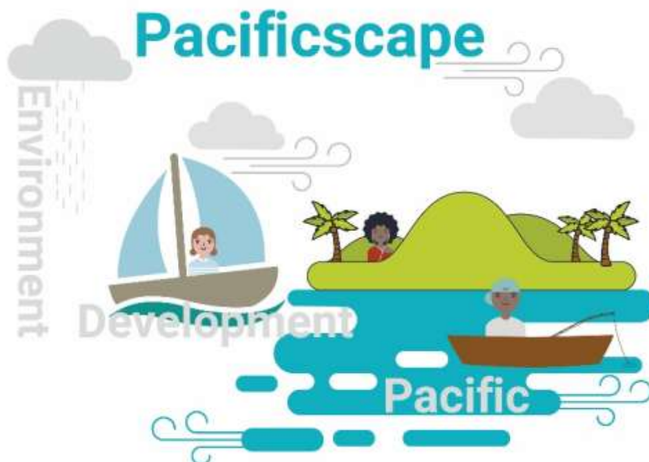
Figure 1: Visual application of Pacificscape. Designer: Laura Porter.

A visual and practical conceptual framework called Pacificscape has been created for this research (see Figure 1). This framework identifies three elements that work together, equally, to guide this research. These three elements are the Pacific (represented by people, land and ocean); the environment (represented by the wind); and development (represented by a boat). These elements of Pacificscape need to not only be present but equal for policy and outcomes to 'sit', listen and be informed by local concerns. The characteristics of Pacificscape are postcoloniality, postdevelopment and reciprocity.