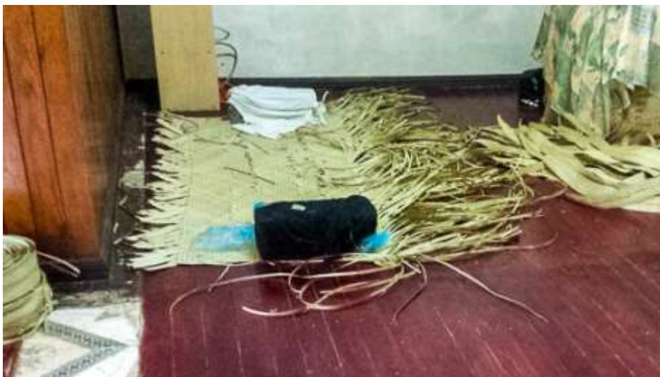
Figure 21: Una's first weaving from beginning to end.

The need for reciprocity to inform policies and outcomes can be seen in the story behind Figure 21. This photo shows the early stage of the first mat that Una Bicinivalu from the Ba province in Viti Levu made herself from beginning to end.