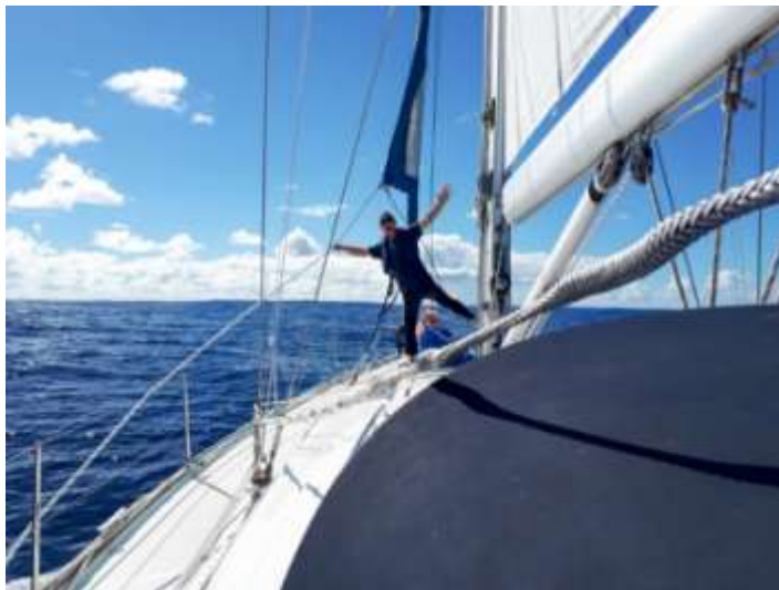
Figure 2: Pacificscape: Development dominates the space.

Figure 2 and Figure 3 offer a photographic narrative of how Pacificscapes' elements currently operate in development. Figure 4 then offers an alternative to this narrative. These photos were taken on route from Aotearoa to Fiji in May 2018.