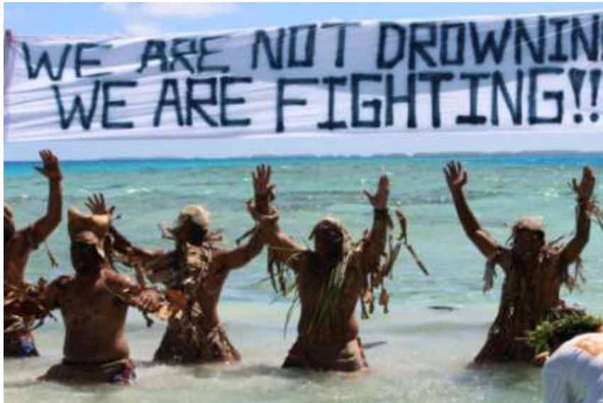
Figure 10: Climate warriors, counteracting ‘vulnerability’ discourse of the Pacific.

people, long marginalised, are denied their own agency in the climate change crisis” (p. 58).