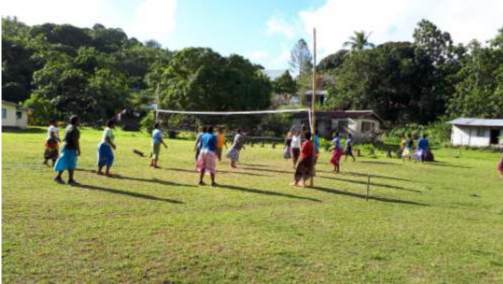
Figure 20: Women exercising in Nawaikama village.