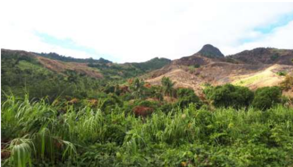
Figure 16: The traditional village site in Arovudi.

Many referred to adaptation in terms of relocation, including receiving advice about relocating to higher ground. Other expressions of relocation included how traditional village structures and vale (family house) and bure (house) buildings could be an opportunity to build villages that would be more climate-proof. However, Rupeni said that this would not be accepted by everyone as it would be seen as “going backwards.” But Rupeni also said that he saw potential in the structure of the previous traditional village on higher ground as a way to retain Fijian culture as well as adapt to climate change (see Figure 16). He said the location of the village was good for gardening, was away from lower coastal ground, and: “Just feels right.”