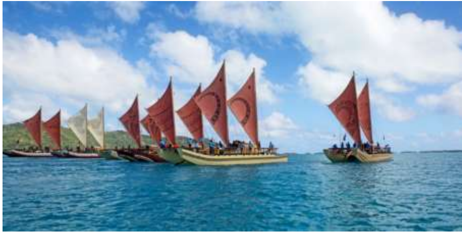
Figure 22: Uto n Yalo Pacific voyagers, based in Fiji.

This integration of tradition and modern is connected with climate change and ocean stewardship. Pacific thinkers have long advocated the ocean and the reciprocity around it to champion development on their own terms. Pratt and Govan (2011) present Oceanscape as a vehicle for ocean policy, saying: