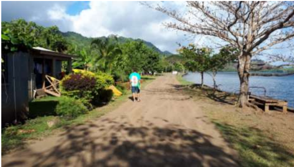
Figure 18: Coastal village of Nawaikama village, Sawaieke District, Gau Island.

climate concern or a development concern because the lines between climate change, adaptation and development appeared largely invisible.