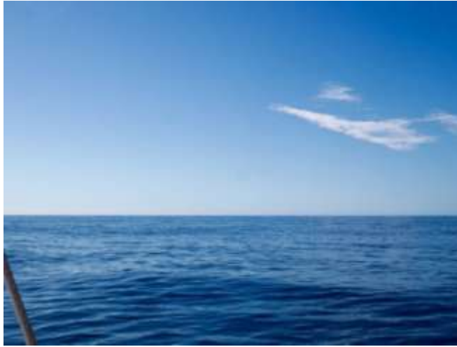
Figure 4: Pacificscape: An alternative focus for development.

responding and reflecting. What is not said is as important as what is said; there other spatial or temporal places to visit.