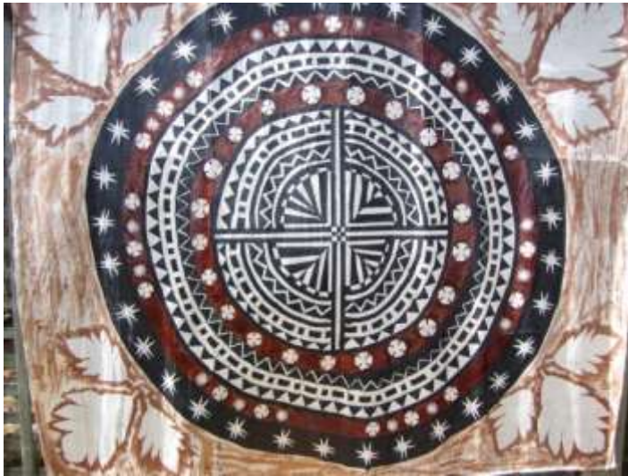
Figure 24: Masi design.

understanding and reconciling the tensions between Western knowledge and indigenous knowledge: