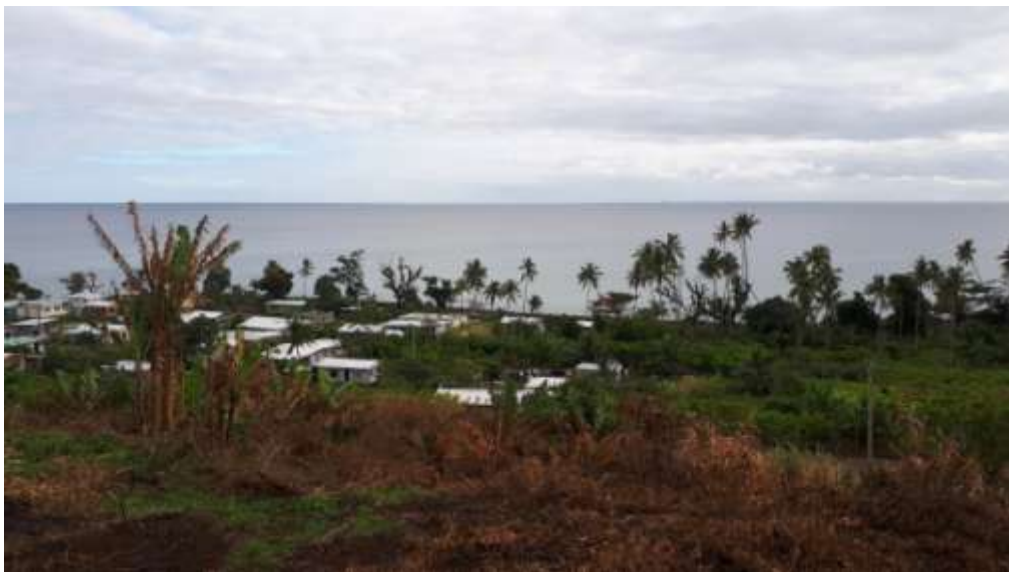
Figure 13: Arovudi village, Ovalau Island.

The Lomaiviti group of islands were one of the worst regions affected by tropical Cyclone Winston on February 20, 2016. People reported that most homes in Arovudi and Taviya were badly damaged, as well as the local church and other community infrastructure. All crops were destroyed, initially leaving the village without food and future income.