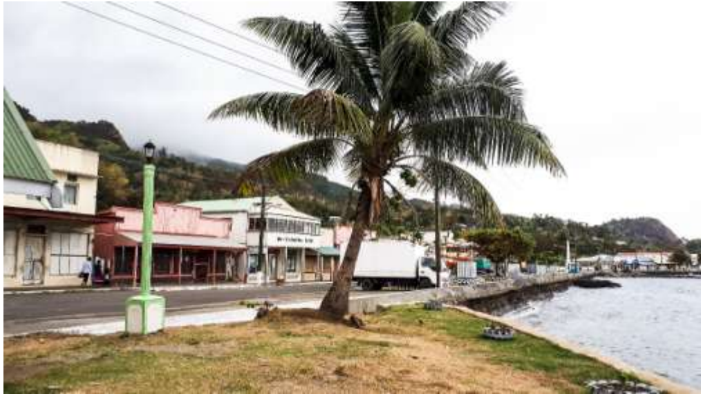
Figure 12: Levuka town, Ovalau Island.

for the residents on Ovalau Island includes work from by resorts on the nearby islands of Moturiki, Leleuvia, Moturiki and Wakaya. Levuka has a local town council and is also the location of the Lomaiviti Provincial Council.