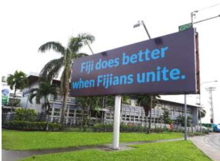
Figure 5: Fiji 2018 election political billboard.

Cross-context research has also allowed me to be open to where 'data' comes from, as can be seen in Figure 5. In Aotearoa, I doubt I would have attended church like I did in Fiji or used modes of transport as research. Grey literature can be anything that evokes a response: rubbish in the ocean, discovery of a local water hole, and shoeshine boys wanting business (who were often men in their 40s and 50s). Knowledge through this method is fluid and ever changing. Ingersoll (2016) expresses knowledge as becoming an emerging process, "born from the movements of bodies affected by places, which can be engaged for specific purposes, only to be readjusted by more movement" (p. 154).