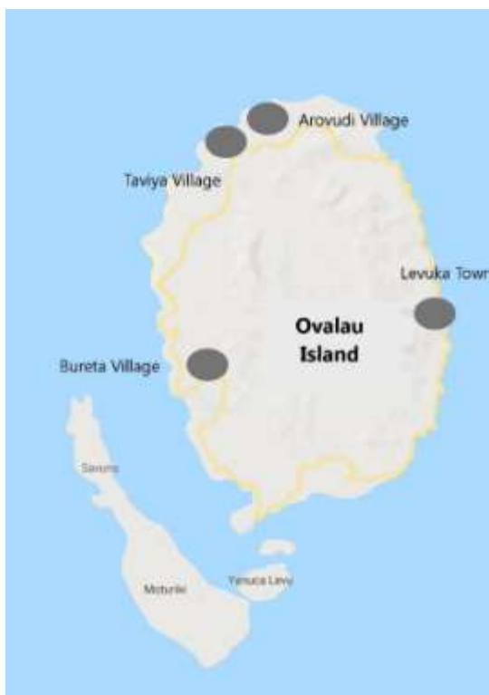
Figure 11: Map of Ovalau Island showing research localities.

This first section presents Va conversations from Ovalau Island, Lomaiviti District of Eastern Fiji (see Figure 11, Figure 12 and Figure 13).