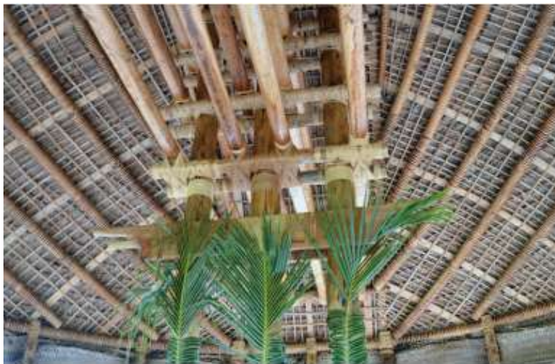
Figure 23: Fale structure.

Huffer and Qalo (2004) argue that we have all been thinking upside down: translation of vanua principles should replace development jargon, and that ethics of self-reliance and alternative economic development is needed. This alternative can be seen in the cultural practice of gift exchange as socioeconomic practice in Papua Guinea (Curry, 2003). Another example of how the translation of vanua principles has been used in action is Unaisi Nabolo-Baba’s Vugalei Fijian Epistemology Pacific framework (2008). This framework has an education focus but it is an example of how concepts such as vanua present a Pacific way of knowing as holistic and relational.