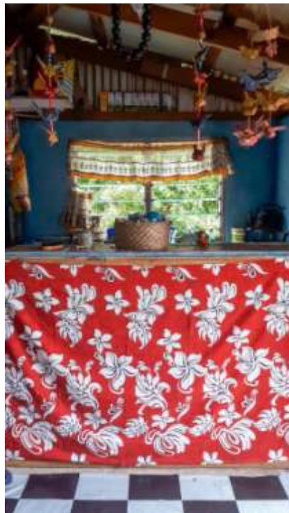
Figure 25: Asena and Rupeni's house, Arovudi village

I am now forever in the Va – the space that relates. This space is growing smaller in time yet expands as I read the Fiji Times online, wrap my sulu around my waist, and sit on the front of the boat, waiting. I watch our pet stingray at the marina moving under the surface of the water. I wear a red flower clip in my hair as I visit the people I met in Fiji again and again, across the ocean. I watch the tide turn.