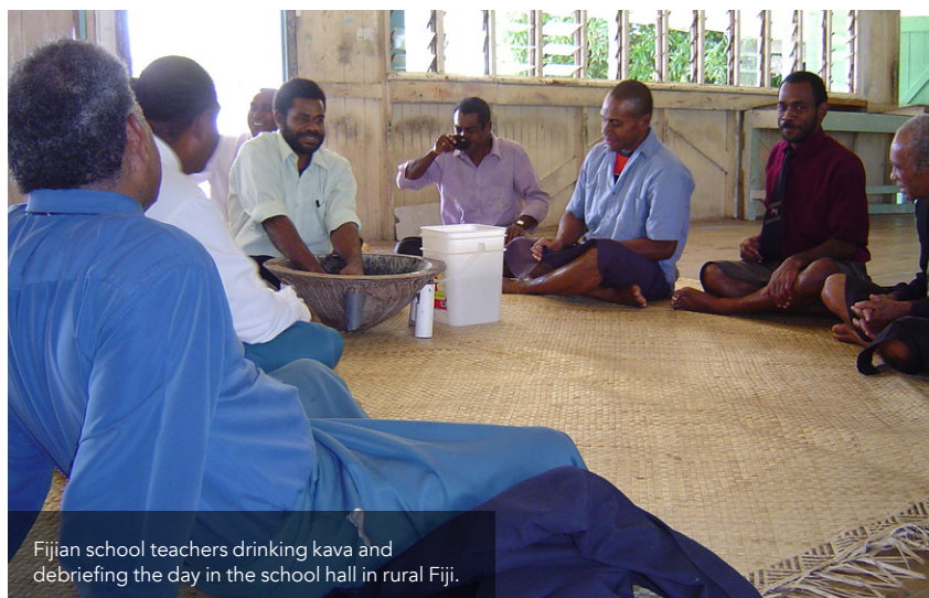
Fijian school teachers drinking kava and debriefing the day in the school hall in rural Fiji.