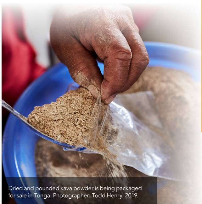
Dried and pounded kava powder is being packaged for sale in Tonga.