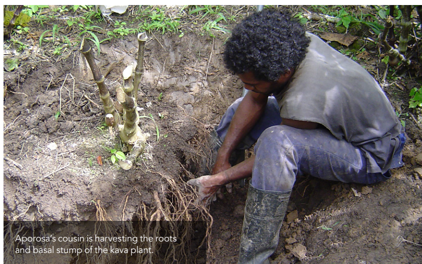
Aporosa's cousin is harvesting the roots and basal stump of the kava plant.

It's the supposed effect of kava on the liver that has received the most negative media coverage. Aporosa explains that this suggestion emerged in Western Europe in early 2000 following reports that 83 patients taking kava tablets as a herbal remedy had died. This caused many countries to ban the sale of kava until Germany's Federal Administrative Court ruled in 2014 that it was unlikely that kava