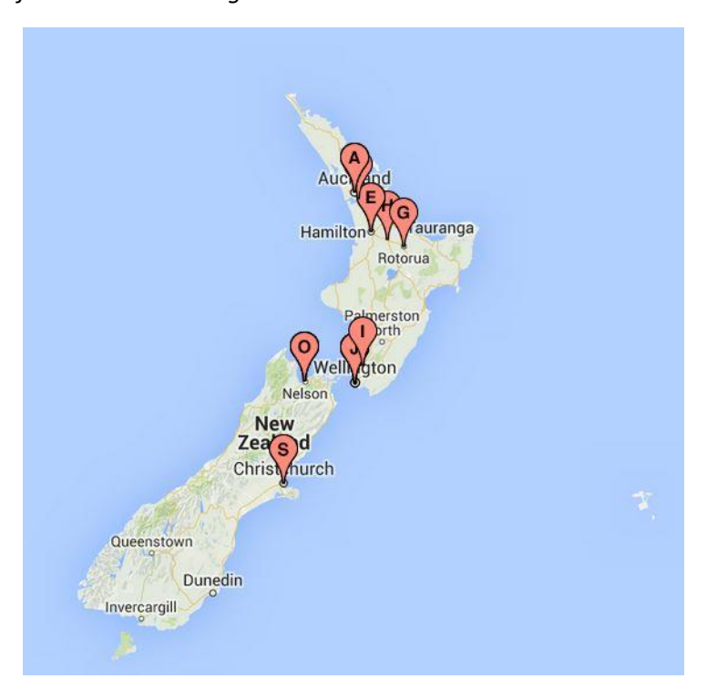
Figure 1: Location of Rainbow sector organisations

The dates of formation of respondent organisations spanned from 1972 to 2015. With young people identifying their sexuality and/or gender identity at increasingly younger ages, the need for formal support for Rainbow young people has increased rapidly in recent years. Eighteen of the 24 organisations answering the Snapshot survey were formed after 2002, many in smaller parts of Aotearoa New Zealand.