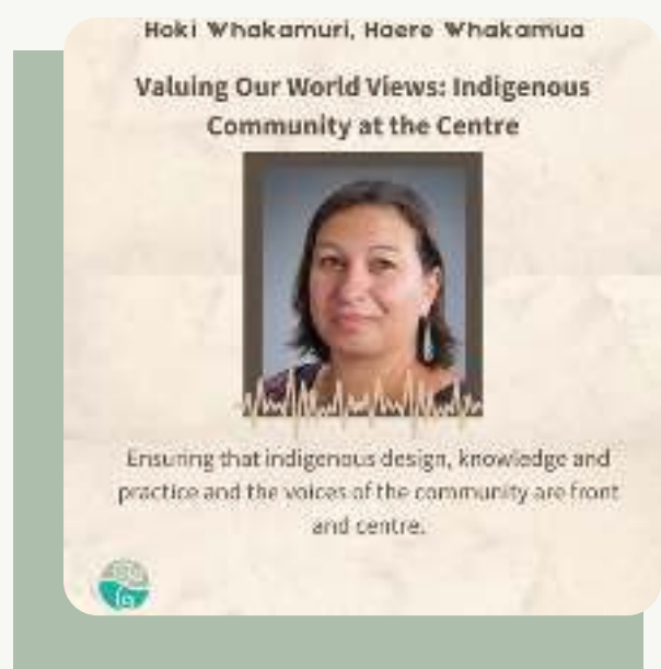
Valuing Our World Views: Indigenous Community at the Centre