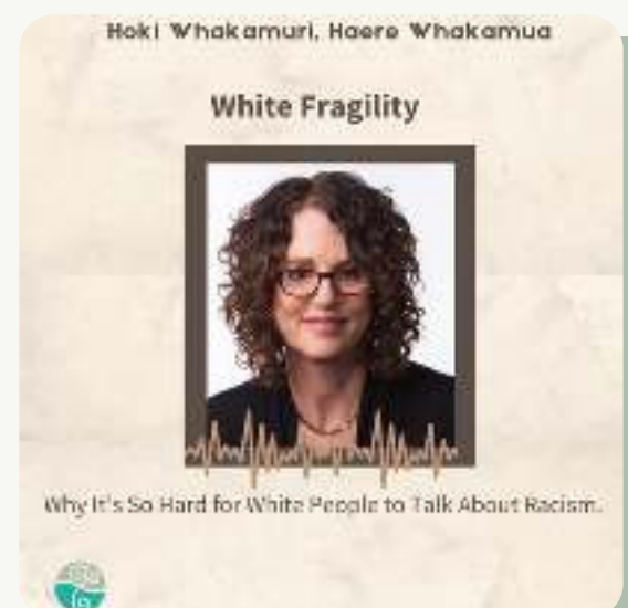
White Fragility - Why It's So Hard for White People to Talk About Racism