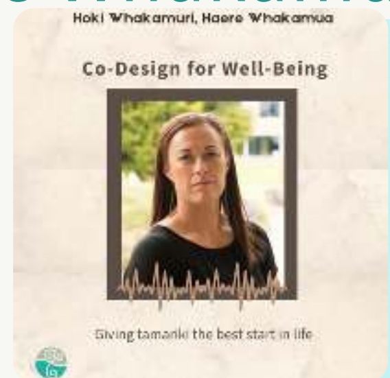
Co-Design for Well-Being: Giving tamariki the best start in life