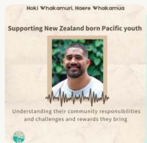
Supporting New Zealand born Pacific youth