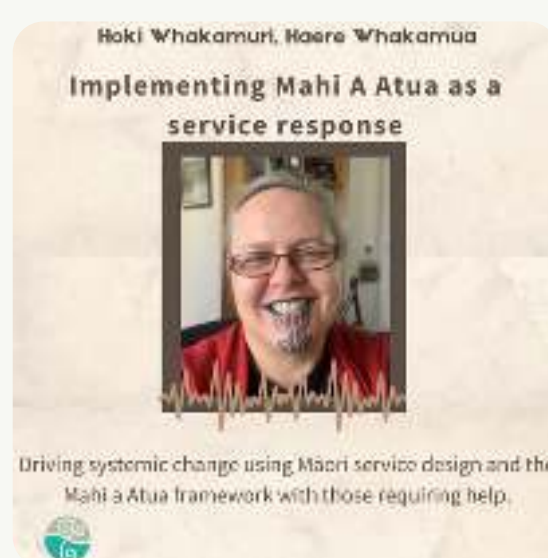
Implementing Mahi A Atua as a service response