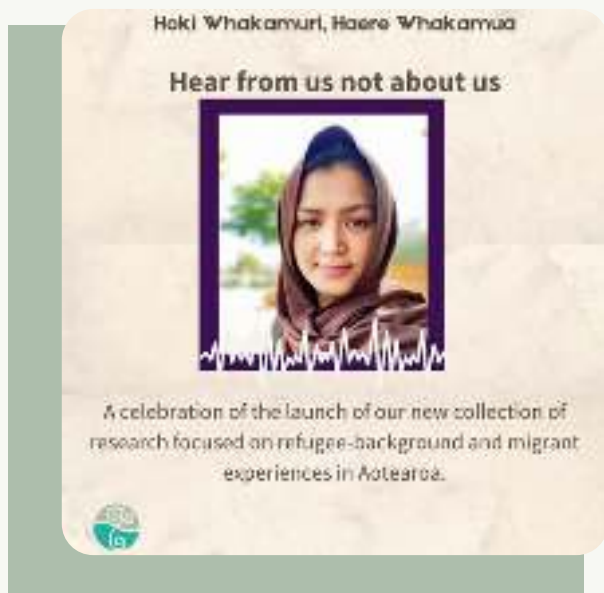
Hear from us, not about us: The power of refugee-background research