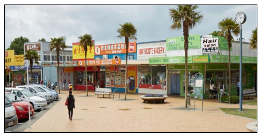
Figure 1 Northcote town centre

Urban change, including population growth and the emergence of new kinds and expressions of diversity, raises important questions for policy makers, community service agencies, and local residents alike. These project briefs are designed to provide research findings related to the meanings and practices of community within neighbourhoods (CaDDANZ Brief 8), how people see difference and how diversity impacts residents' sense of home and community (CaDDANZ Brief 9), the significance of the local neighbourhood for the wellbeing of older adults (CaDDANZ Brief 10), and residents' perceptions and experiences of the Northcote Development (CaDDANZ Brief 11).